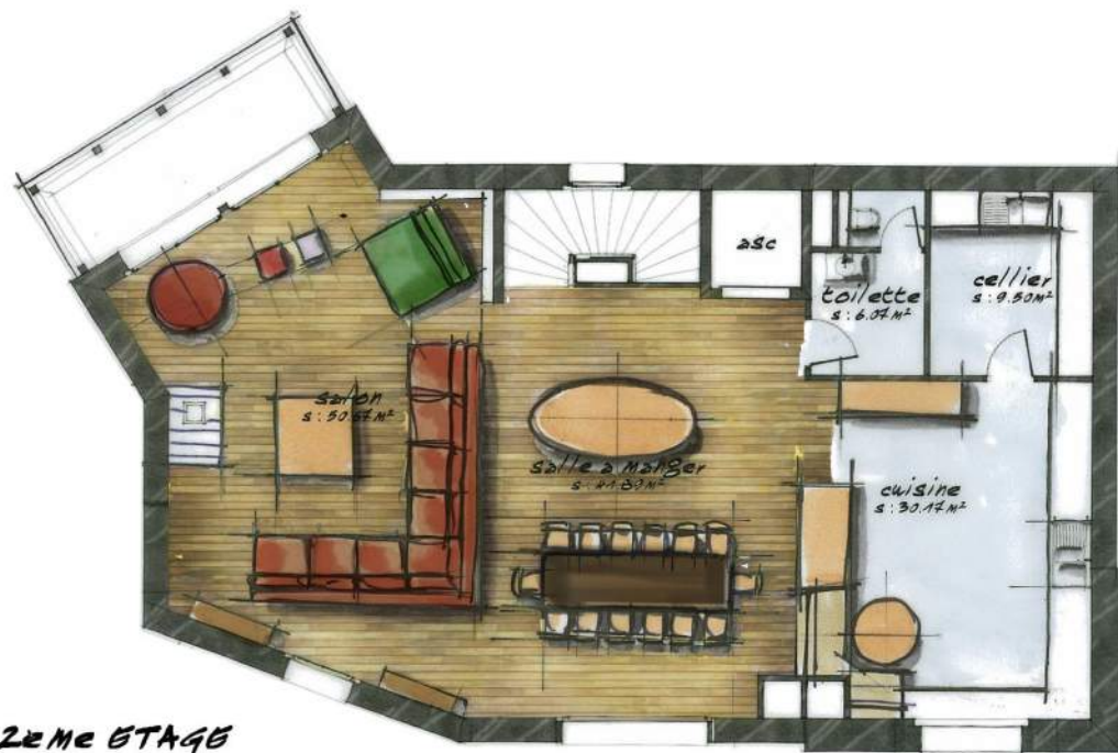
CHALET 2- 2eme ETAGE